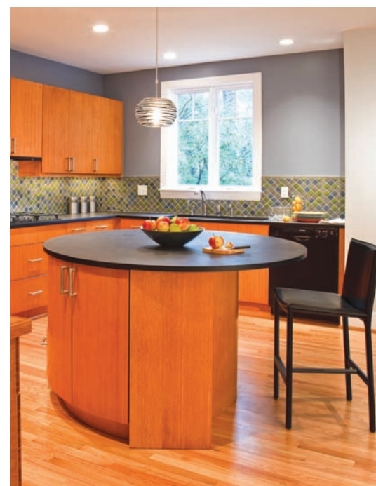
Recycled glass backsplash, bamboo floors, and a PaperStone countertop result in a kitchen that works for the client and the environment.

Recycled glass is a great way to get an attractive, cost-effective, and guilt-free kitchen backsplash. For a recent kitchen remodel, Wentworth utilized Sandhill