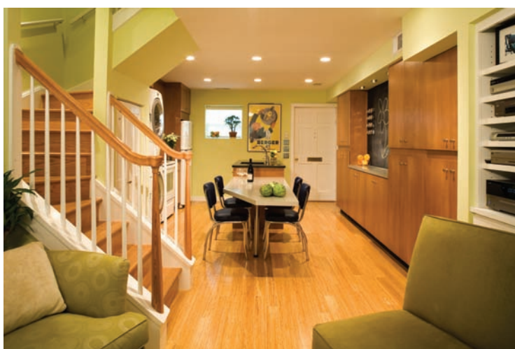
Bamboo Floors in a Wentworth, Inc. Kitchen Remodel

As eco-friendly construction and products move into the mainstream design process, design professionals are becoming more knowledgeable and savvy about what works and what doesn't when it comes to green construction. While building new is great, incorporating green elements into a home renovation is even greater, particularly in historical neighborhoods where a home's unique character is protected and building new is infrequent.