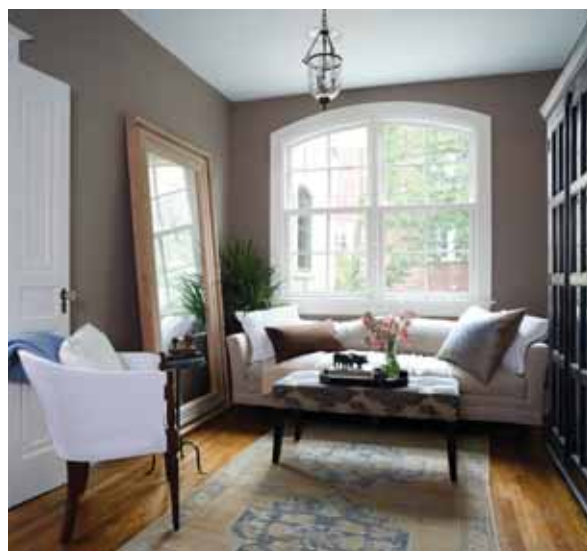
New arched-top windows in an enlarged family room resemble those found in Italian and French architecture

heating, cooling or insulation, and the old wood floor sloped for drainage. Because the porch was unusable for daily use, it was being used for storage by the homeowner. An ample space, the porch measured 18' x 10', and it provided for generous new bedrooms when they were combined. The rear brick wall was cut open and beams were installed to allow for the integration of the bedroom and porch. The existing oak flooring was extended,