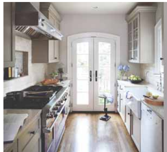
A creative expansion of a DC row house gives the homeowner a custom cook's kitchen, complete with a cobalt blue Viking range and farm sink

In addition to ensuring that the remodeling project maintained the architectural integrity of her home, the homeowner also sought us out to design a "cook's kitchen." Requirements for the