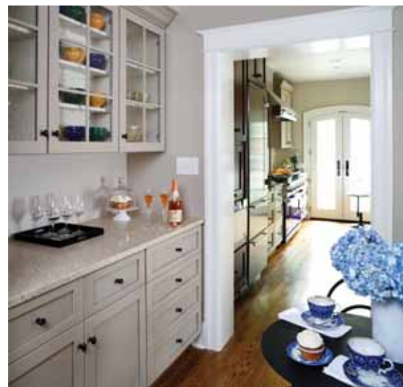
The addition of a butler's pantry and painted cabinetry with glass doors adds storage for the homeowner's collections of china, silver, and glassware

kitchen included a cobalt blue 48" wide Viking range, a window over a large farm sink, and sufficient cabinet space to store collections of china, silver, glassware, copperware, and linens. After many years of personal collecting, coupled over the years with inherited family collections, organized storage and display were essential